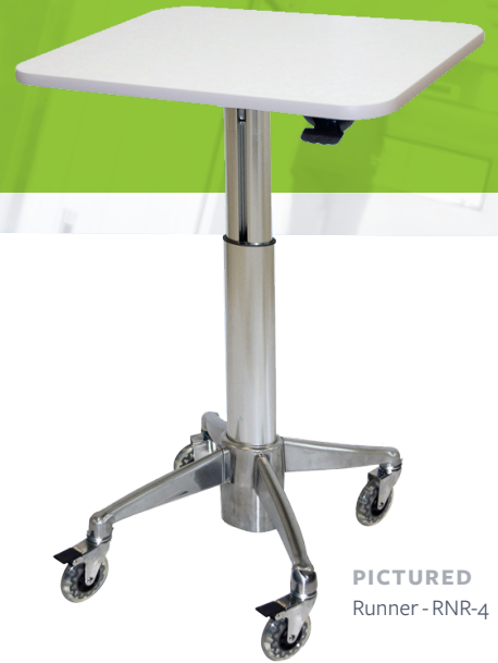
PICTURED Runner - RNR-4