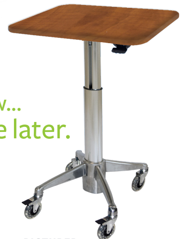
PICTURED Runner - RNR-4 in Amati Walnut