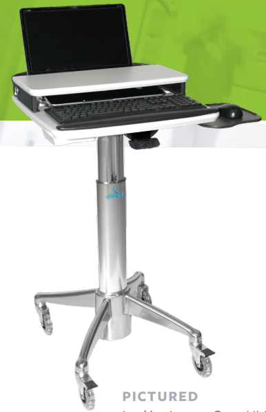
PICTURED Locking Laptop Cart - HLC7P2